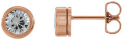
653372 • Rose Gold Bezel-Set Earrings