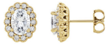
652489 • Yellow Gold Accented Halo-Style Earrings

Looking for more? Shop Charles & Colvard Moissanite fine jewelry trends on Stuller.com.