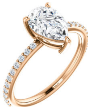
653391 • Rose Gold Pear Accented Engagement Ring