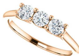
653395 • Rose Gold Three-Stone Anniversary Band