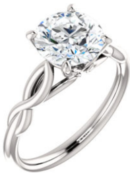
653381 • White Gold Solitaire Engagement Ring

It's no secret that moissanite delivers unique value to consumers. Charles & Colvard's Exotic Gems are the perfect example. Suggest this option to those searching for value-driven, high-quality designs. Exotic Gems range from six to 15.5 carats. These big beauties afford your customers the ability to design extravagant, custom engagement rings that perfectly align with the latest moissanite fine jewelry trends.