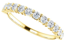
653397 • Yellow Gold Forever One Anniversary Band

Moissanite eternity and anniversary bands are dynamic, yet also very personal. Pile on three or more bands to create a stacked look, or pair them with a favorite statement ring for a complementary approach. These fabulous bands also double as wedding bands themselves that won't overpower a strong engagement ring. Accented with Forever One™ melee and gemstones, these frontrunning moissanite fine jewelry trends add more bling to any budget.