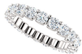
653400 • White Gold Forever One Eternity Band