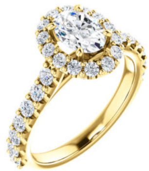
653384 • Yellow Gold Halo Style Engagement Ring