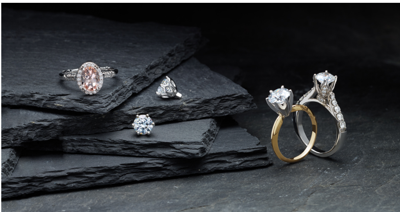
Erica's engagement ring ( 140309L:9183:P ) pictured on right